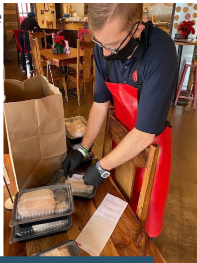
All hands on deck for Help for Hunger!