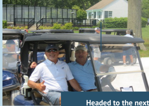
↖ Headed to the next green on the course!

seeing his son take responsibility for his work at the Cafe and is sure that many other parents feel the same.