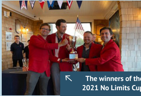
↖ The winners of the 2021 No Limits Cup