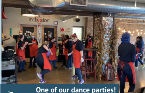
➔ One of our dance parties!

We are excited for these 3 former employees and we know that they will continue to show the community all that adults with intellectual disabilities can achieve!