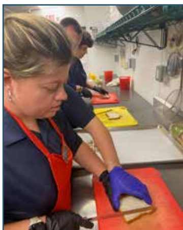
DEMI NLC prep