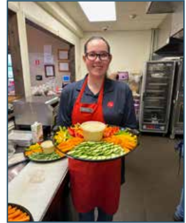
ANGIE NLC server