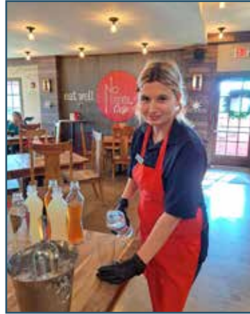
CHELSEA NLC server