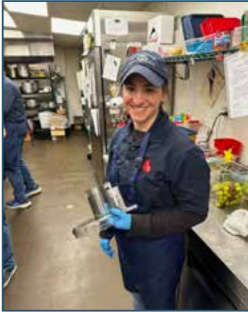
HEATHER NLC server & prep

Suzanne Hatfield Training Program graduates that have assumed responsibilities at No Limits Cafe, filling roles left vacant by our employees on the preceding page who have transitioned to new opportunities!